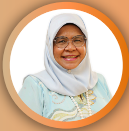
KEYNOTE SPEAKER Maimunah Mohd Sharif Executive Director UN-Habitat

Ms. Maimunah Mohd Sharif is the Executive Director of the United Nations Human Settlements Programme (UN-Habitat) – an office held since 2017, at the level of Under-Secretary-General. Since joining the United Nations, Ms. Sharif has reformed and repositioned UN-Habitat as a thought leader in sustainable urbanization. She is a vocal advocate for the implementation of the New Urban Agenda to achieve Sustainable Development Goals and the nationally determined contributions to the Climate Action Paris Agreement.